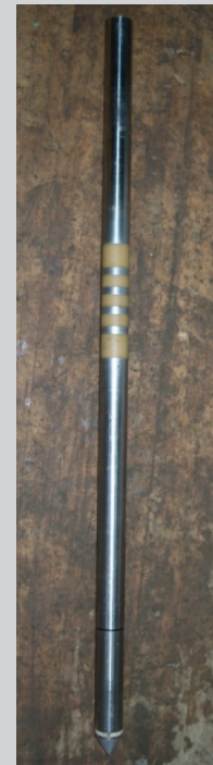
The SMC showing the standard Piezocone on the end and the 2 outer rings which measure resistivity and the two inner rings which measure the dielectric constant